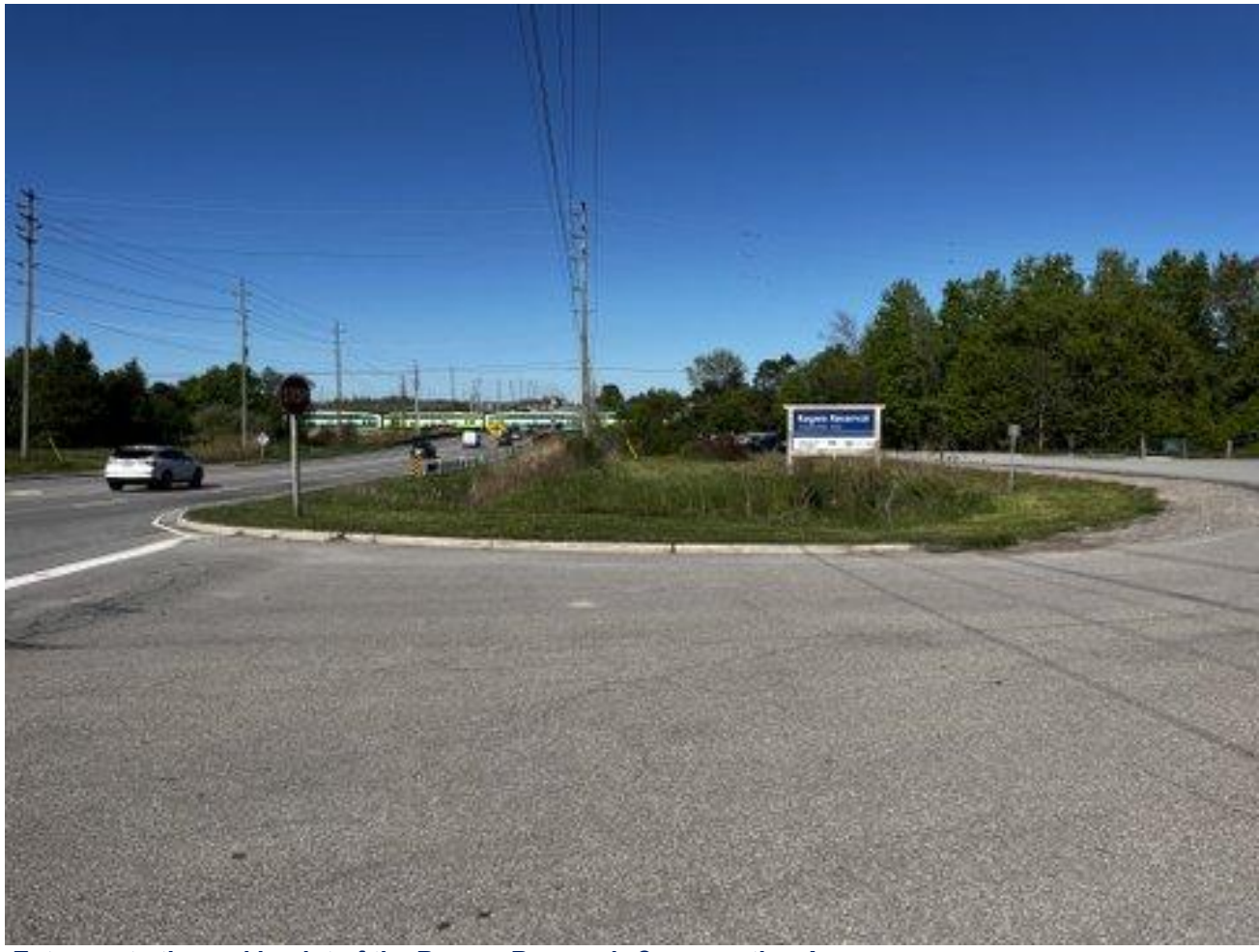
Entrance to the parking lot of the Rogers Reservoir Conservation Area